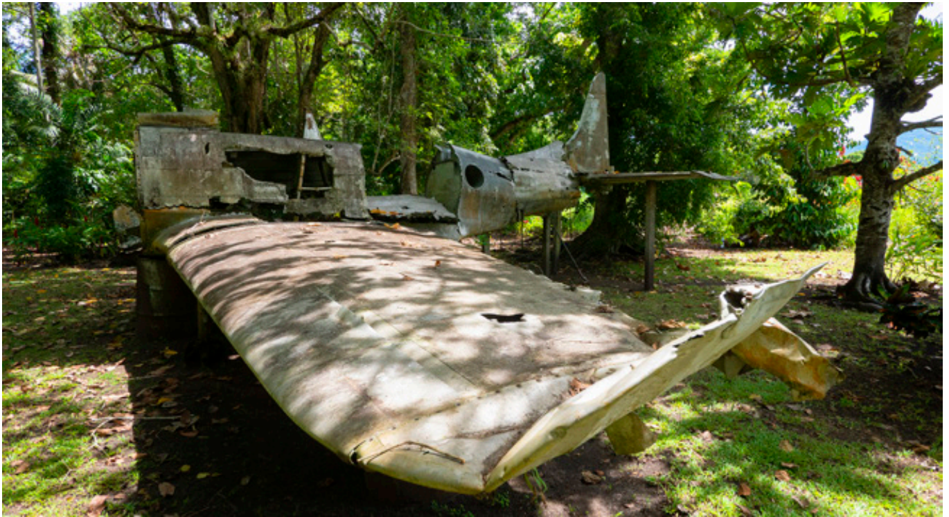
A battered fighter at the Vilu outdoor War museum