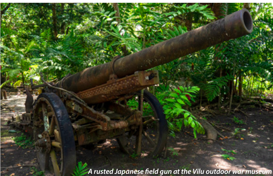
A rusted Japanese field gun at the Vilu outdoor war museum

The highlight of this wreck for me though was the cathedral-like engine room at 8m, which is tiger-