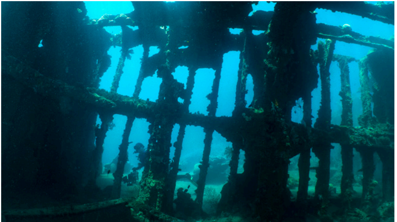
The cathedral-like engine room of the Kinugawa Maru

striped with shafts of light and shadow.