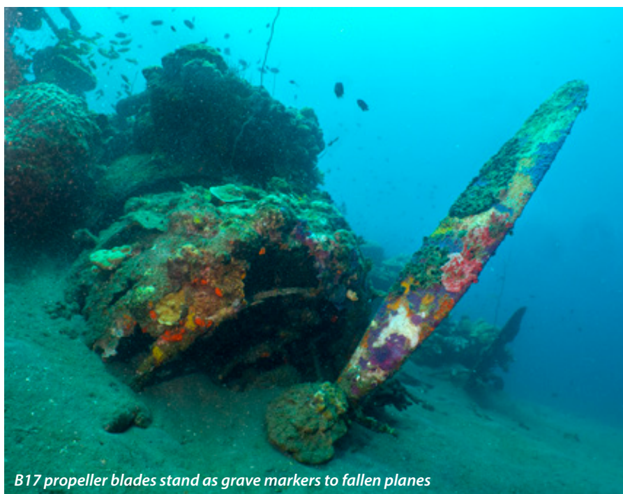
B17 propeller blades stand as grave markers to fallen planes

When you head away for a dive trip to a place with more than 900 islands bathed in clear tropical waters renowned for shipwrecks and volcanoes you know you're in for some great diving!