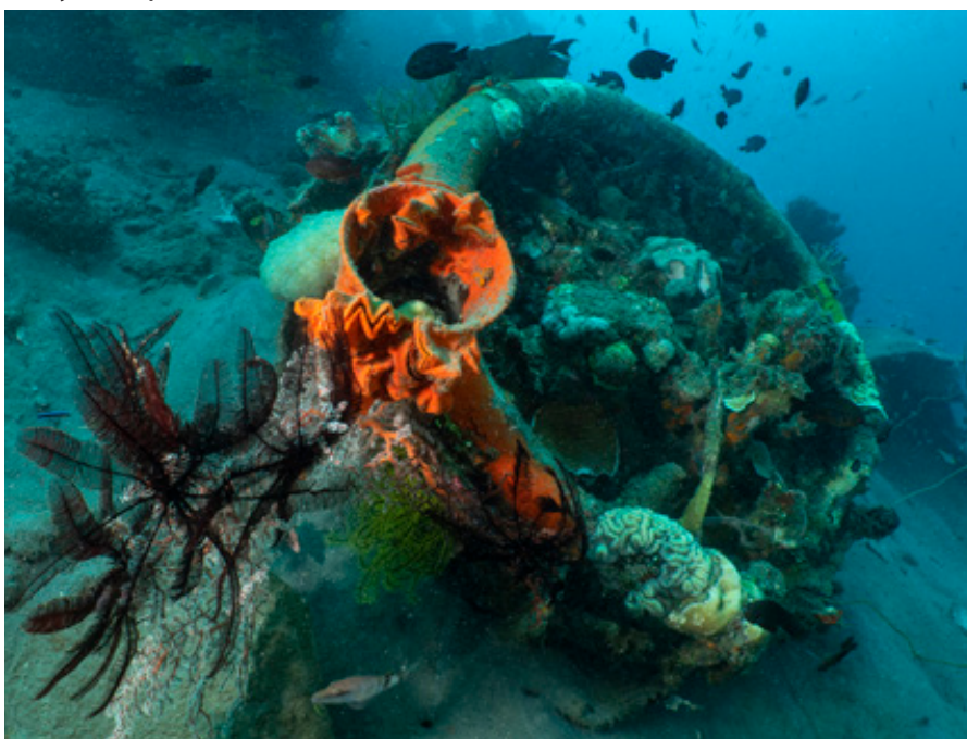
Encrusting life providing a splash of colour to one of the engines of 'Bessy the Gap Basher', a B17 Bomber

along the gun barrels, and feel the bullet holes in a plane's wing, brought home the reality of war far more than words can.