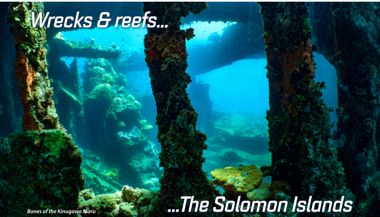
Bones of the Kinugawa Maru