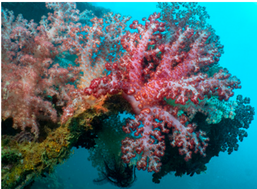
Beautiful soft corals adorn many of the Solomon's WWII wrecks

With a 'surface interval day' to spend around Honiara before flying on to Gizo we took the opportunity to visit the Vilu outdoor war museum, an amazing collection of war relics from Japanese field guns to bomber and fighter planes. Being able to walk around and run a hand