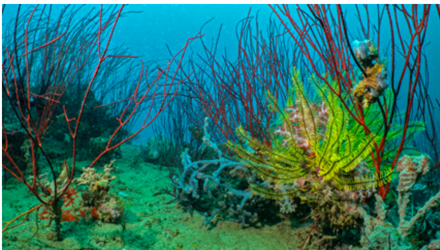
Red whip corals on the hull of the I-1 submarine